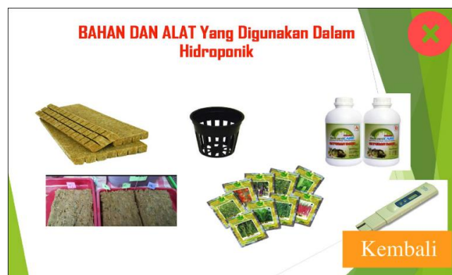
Figure 9. Quiz Display