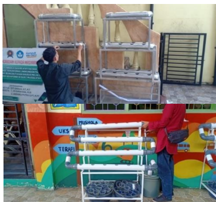
Figure 4. Service Products to be Provided to Partners

The program was carried out from 21 to 22 September 2022. The activities were attended by SLB students and teachers in the Muzdalifah SLB C school environment. Implementation of activities in several stages, namely: