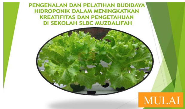
Figure 6. Introduction Display