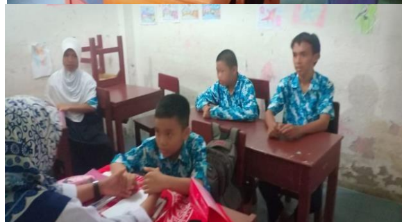
Figure 2. ABK Learning Atmosphere at SLB C Muzdalifah