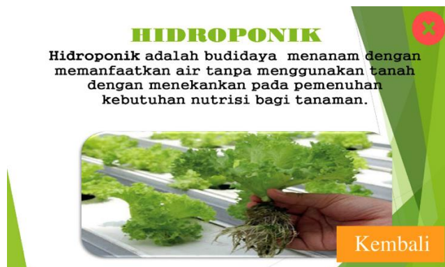
Figure 8. Material Display