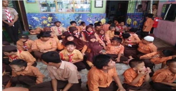
Figure 1. Students at SLB C Muzdalifah

Special School (SLB) C Muzdalifah is a school intended for children with special needs (ABK) Mentally disabled, located on Jalan Garu VI, Gg Merak No.15 A, with a building area consisting of two floors having a total of students as many as 78 students.