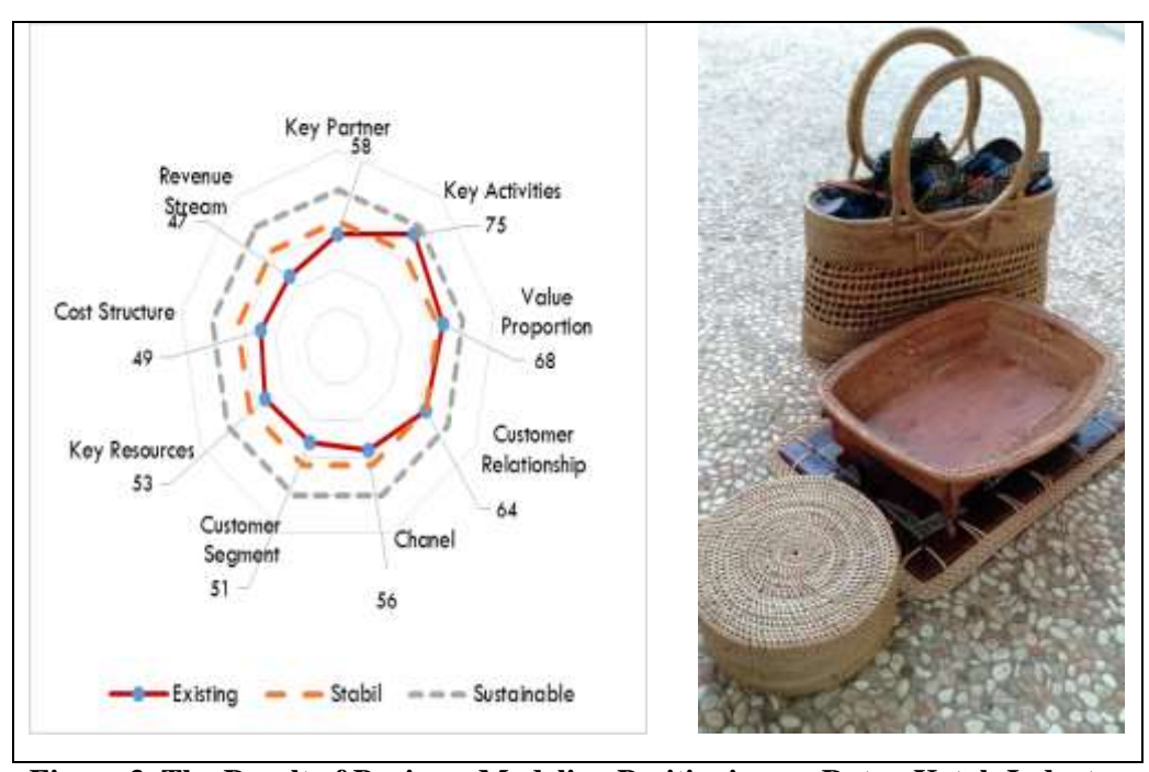
Figure 3. The Result of Business Modeling Positioning on Rotan Ketak Industry in Central Lombok

The results of identification using the nine elements of the Canvas Model indicate that the main strength of the current business model is the aspect of key activities that are demonstrated by making various crafts. This expertise (especially) in women has been mastered for generations. Girls in Lombok have been accustomed to learning to weave and make handicrafts from childhood. Weaving and making crafts programs are also introduced in formal schools. This custom contributes greatly to the development of the region, bearing in mind the expertise of these Lombok women is not easily imitated and is sustainable because it is passed down across generations.