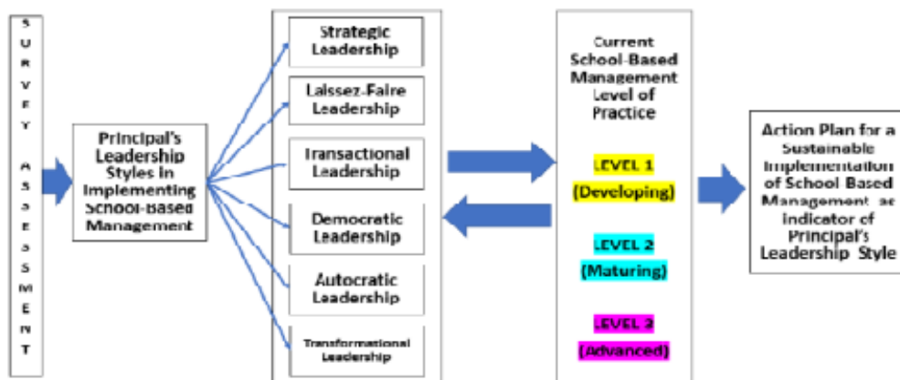
Figure 1. Research Paradigm

This theory focuses mainly on involving community and parents, stakeholders, and administrators in the school decision-making process rather than putting them entirely in control. However, in cases, community and school administrator plays a great role in decision-making and the precise definition of these roles affect how SBM activities are conceived and implemented. It emphasizes that SBM in almost all its angle and manifestations involves community members in the school decision-making. This is because these stakeholders and community members are usually the parents of children enrolled in the school and they should have the concern on developing learning processes in schools. As a result, SBM objectives may be defined possibly achieved in this collaboration. In some cases, training in shared decision-making, interpersonal skills and management skills is offered to school members so that they can become more capable participants in the SBM process (Hui & Cheung, 2006). Figure 1 presents the paradigm of the study in determining the principals’ leadership styles in implementing school-based management and its’ relationship in the current level of practice.