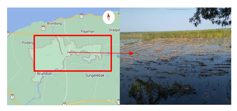
Fig.1. – The Study Area

The most extensive distribution of kenaf in Indonesia is in Bonorowo, Laren, and Lamongan. Bonorowo land is land that becomes swamped during the rainy season. Therefore, kenaf cultivation on Bonorowo land benefits the kenaf cultivation process. However, Bonorowo land has drawbacks because the soil pH and nutrient content are low, while the Fe and aluminium content is high, so sometimes waterlogging is challenging to control. The condition of the Bonorowo land in Laren is shown in Figure 1.