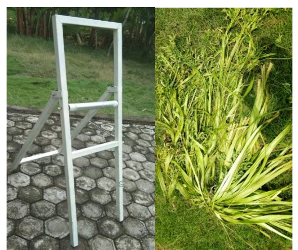
Fig. 3. (a) The Conventional Fiber Machine Used by Kenaf Farmers in Laren; (B) The Result of Gluing with Conventional Fiber Machine

IPA is done by calculating the average value of each attribute's level of importance and level of performance. Based on the average value obtained from each attribute, the global average value for performance and importance is calculated. The average value will be the dividing line in the IPA matrix. The average values of performance and importance are presented in Table 3. After getting the average value, as shown in Table 3, the next step is to draw the IPA matrix using the instructions in Figure 4.