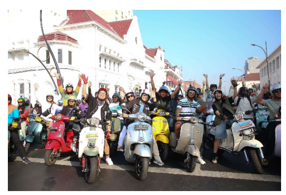
Picture 1. Eri Cahyadi Photo with Vespa Community

The visual aspect of the news also plays an important role in shaping the image of Mayor Eri Cahyadi. Photos showing the Mayor interacting directly with sunmori participants and visiting various tourist locations in Kota Lama provide a real picture of his active involvement and support for the event. These images not only add to the appeal of the news but also provide a visual context that reinforces the positive narrative. By showing the Mayor in informal and friendly situations, such as taking pictures with participants, the news reinforces the Mayor's visual image as an approachable and active leader. In addition, the visualization of visits to tourist locations provides concrete evidence of the Mayor's efforts in promoting city tourism. The images work together with the news text to create a coherent narrative and support the positive image of Mayor Eri Cahyadi as a loyal supporter of community activities and tourism development.